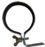
Standard Mounting Bracket

Products specifications are subject to change.