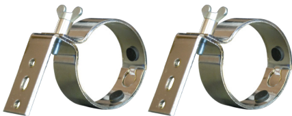
Standard Mounting Brackets (Included)

Products specifications are subject to change.