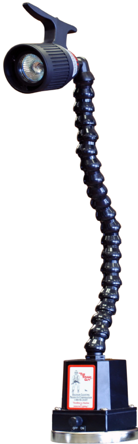
Shown mounted with HLP-24-005 magnet (Not included)